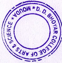
PRINCIPAL D. D. BHOYAR COLLEGE OF ARTS & SCIENCE MOUDA